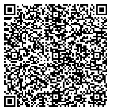
SCAN QR CODE